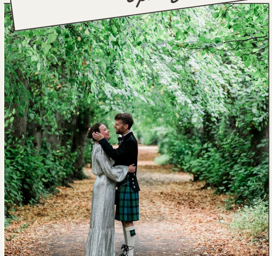
Maxwell Park Autumn