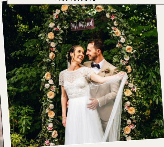
Loggia garden arch