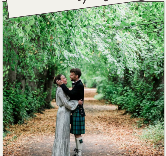
Maxwell Park Autumn