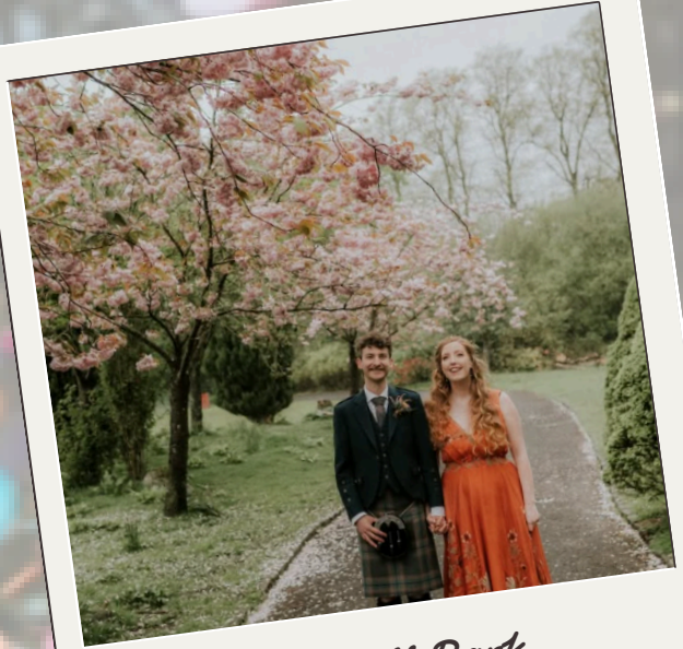
Maxwell Park Spring