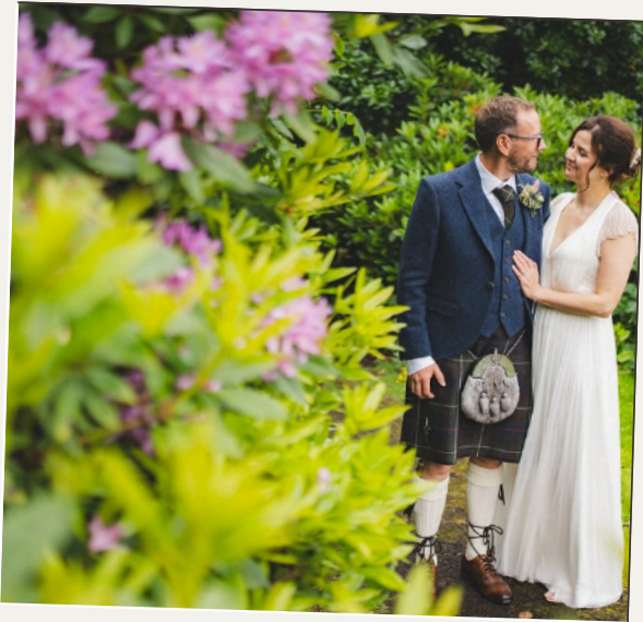
Maxwell Park Summer