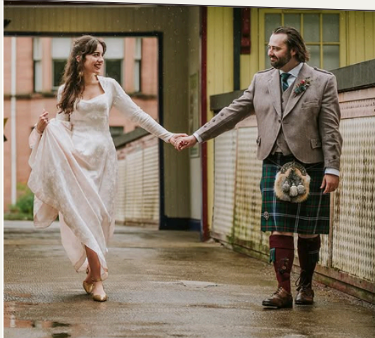
Maxwell Park Train Station