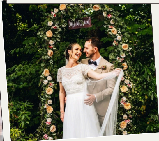
Loggia garden arch