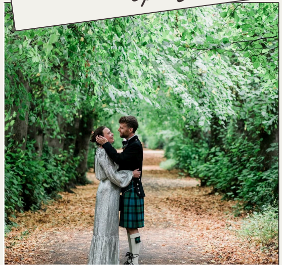
Maxwell Park Autumn