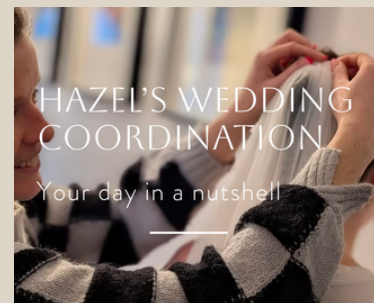
Wedding Coordinator HWC