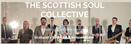
The Scottish Soul Collective