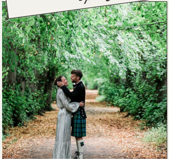
Maxwell Park Autumn