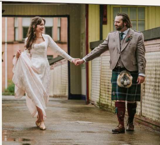
Maxwell Park Train Station