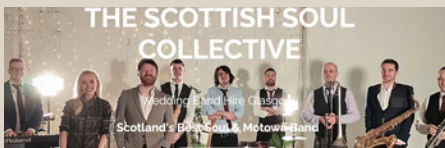
The Scottish Soul Collective