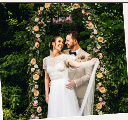
Loggia garden arch