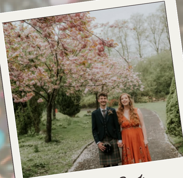
Maxwell Park Spring